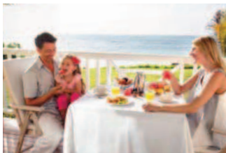
Club Med Spa* by Comfort Zone