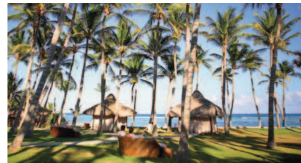
Club Med Spa* by Comfort Zone, palapas