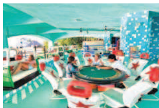
Club Med Passport®